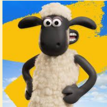
Shawn the Sheep